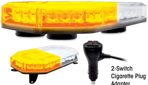
2-Switch Cigarette Plug Adapter