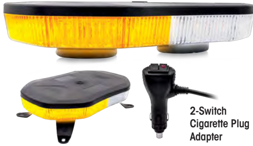
2-Switch Cigarette Plug Adapter